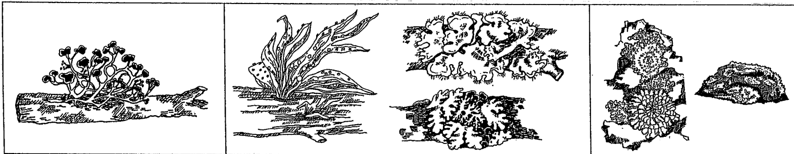
Type A Fruticose

On your hike today keep your eyes out for lichen growing on tree limbs or on rocks. When you find one, use the examples to figure out what type it may be and then tally it in the table below. When you return home tonight, see if you can find any lichen in your own yard.